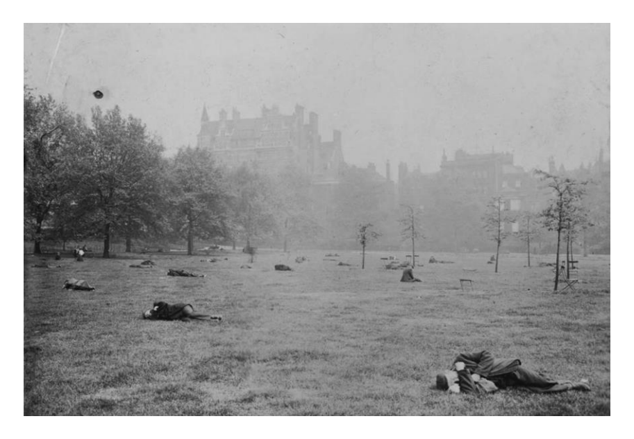
Figure 4. View in Green Park, men sleeping, Jack London, 1902. JLP 466 Alb. 28 #03602, The Huntington Library, San Marino, California.

The contrast between the pomp of the ruling class and the poverty of the East End clearly emerges in chapter X. After spending all night in search of a shelter, the writer ends up in Green Park, where the lawn looks like a battlefield where the homeless lay exhausted, surrounded by fog. A few hours later, the park is crowded with the wealthy West End people. The two scenes (see Figures 4 and 5) are printed in the book, one after the other; the echo bouncing between the photographs and the text contributes to convey the desolation of the poor and the writer's restive attack to the institutions: "All night long they make the homeless ones walk up and down. They drive them out of doors and passages, and lock them out of the parks. The evident intention of all this is to deprive them of sleep" (London 1903, p. 118). The juxtaposition of the scenes personally witnessed by the author and his considerations bring about an amplifying effect; photographs and written commentary compensate each other and, by a sort of a boomerang trajectory, conjure up a complete image of the slums and allow the reader to reflect on the political and social implications of their condition.