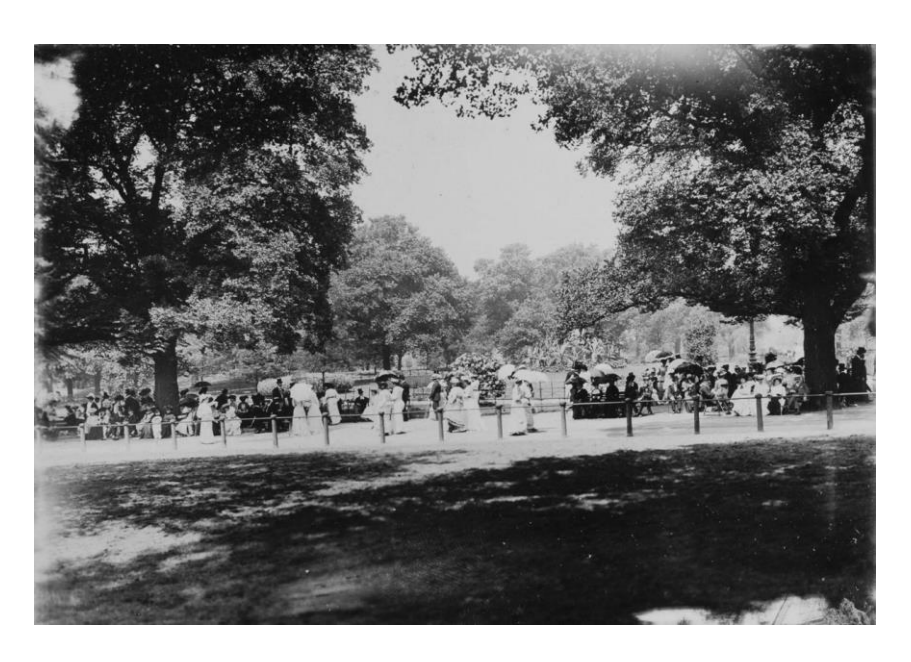
Figure 5. Sunday afternoon well-dressed West Enders with their wives, Jack London, 1902. JLP 466 Alb. 28 #03603