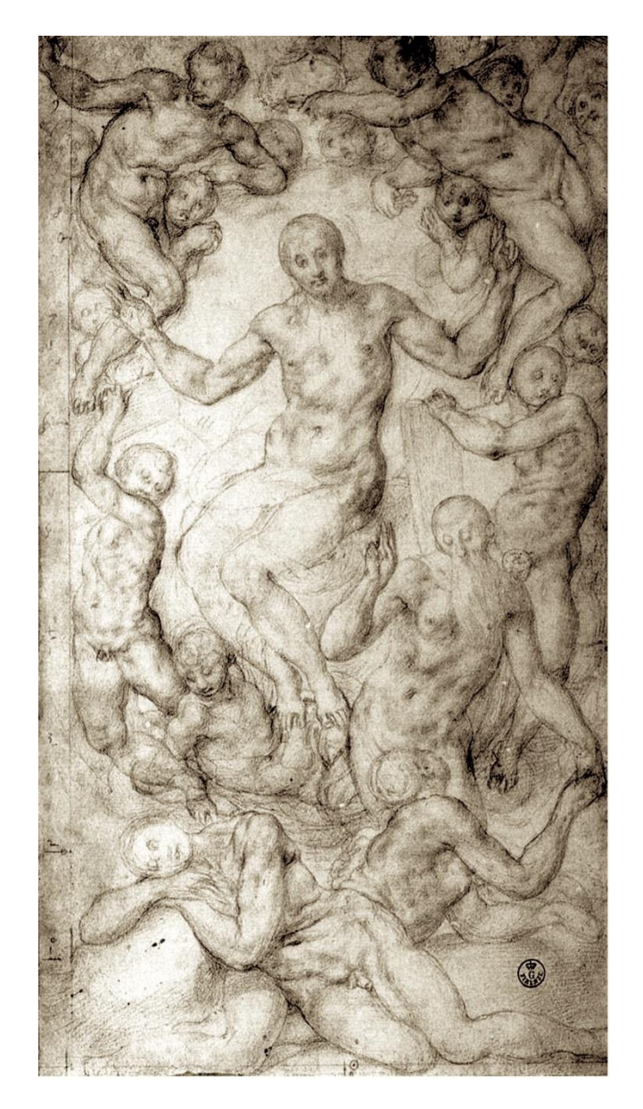
Figure 3: Jacopo Pontormo, Christ in Majesty with The Creation of Eve, c.1550, drawing. Uffizi, Department of Prints and Drawings, Uffizi, Florence.