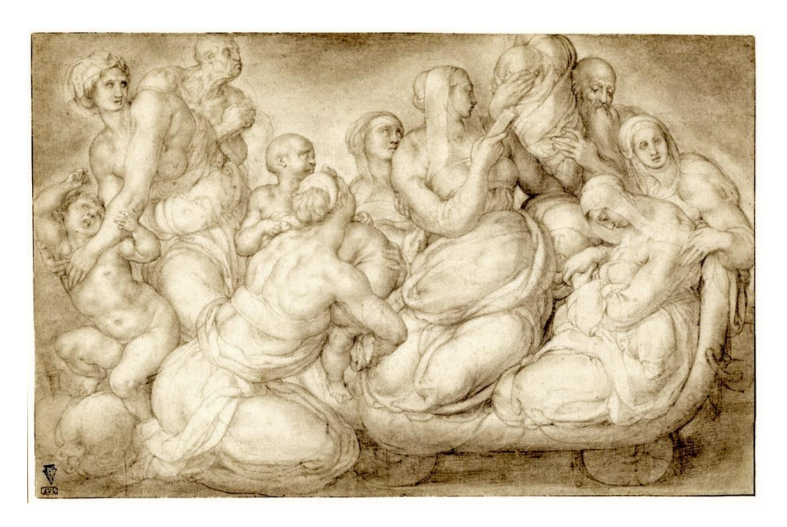
Figure 4: Agnolo Bronzino or Jacopo Pontormo, attr. Blessing of the Seed of Noah, 1555–1557, drawing. Drawings Department, British Museum, London (1974,0406.36).

147 and fig. 90) a reference to a Hell section survives in a drawing by Pontormo of a Demon Dragging a Soul to Hell , now in Galleria degli Uffizi in Florence.<sup>17</sup>